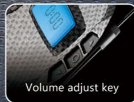
Volume adjust key